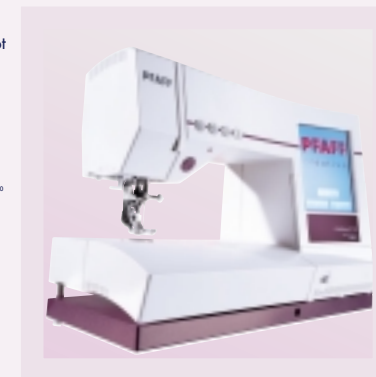
Sew like a pro – with the Pfaff creative 2170 !

Templates, special presser feet, patterns, instructions with inspiring suggestions – with one of the Pfaff TOOLBOXes and or "Start to Appliqué", you can start making your ideas come true right away. For example: QUILTER'S TOOLBOX, Decorative TOOLBOX, Start to Appliqué.